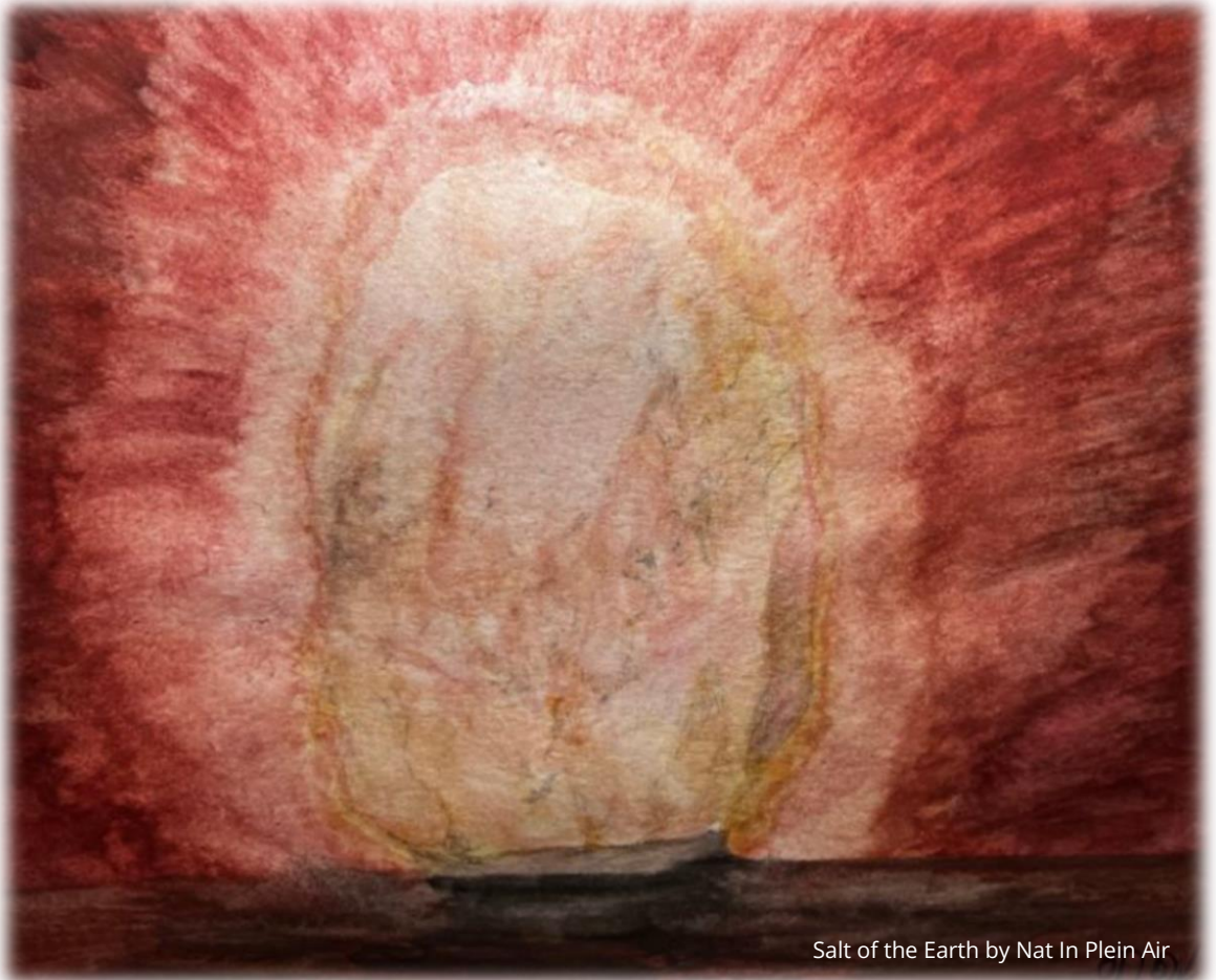
Salt of the Earth by Nat In Plein Air

Fairlawn Avenue United Church Sunday February 8, 2026 10:30am