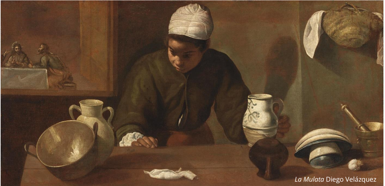
La Mulata Diego Velázquez

Fairlawn Avenue United Church Sunday, April 19, 2026 10:30am Third Sunday of Easter